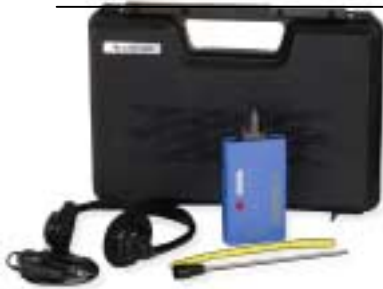
VPE KIT includes VPE meter, headset, waveguide, stainless steel probe and ABS carrying case.

AccuTrak Model VPE offers high sensitivity & great sound quality in a compact package designed for one hand operation. Includes flexible waveguide for hard to reach areas, and hard molded carrying case. Important features: Low cost and highly sensitive, Small and simple to use, runs on 9v battery, patented technology, classic heterodyne detector, designed for use in areas of low to moderate background noise.