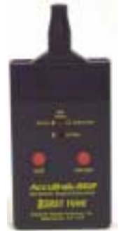
SG2 Sound Generator