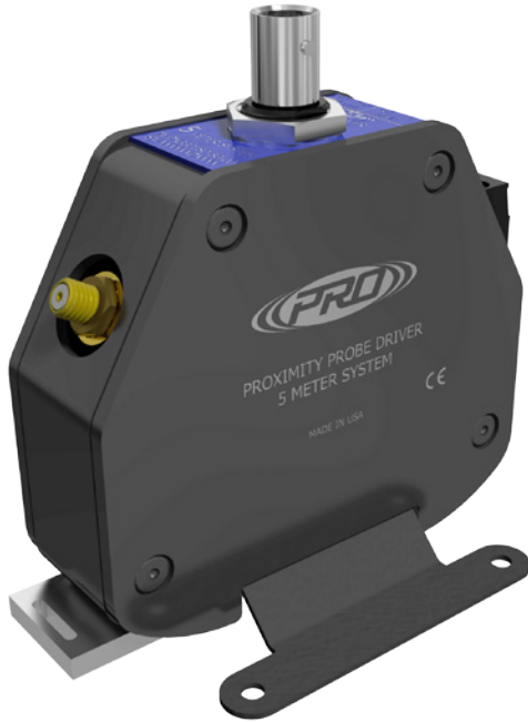
Panel Mount Option (Shown Above)